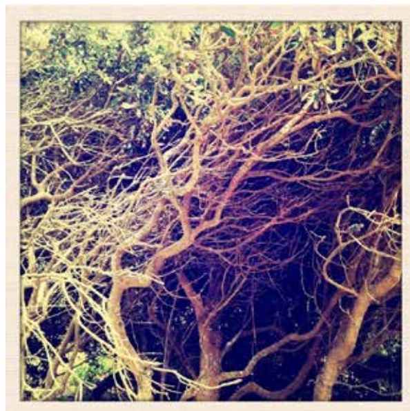
Kay S Lawrence, Varicose , 2010. Digital image archival pigment on canvas, 90 x 90 cm.

At the heart of the exhibition and the artist's research is the exploration of 'women's work' – needlework techniques and other textile techniques (m)aligned with females, including embroidery, knitting, crochet, and binding – and the inherent materiality of these mediums beyond their obvious aesthetic attributes.