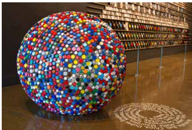
Alison McDonald, Global , 2013. Up-cycled plastic lids, cable ties, PVC, 120 x 120 cm.

The collection subconsciously fostered a fascination for pattern and intricacy in natural objects – a fascination that has found expression through Joanna's glass practice.