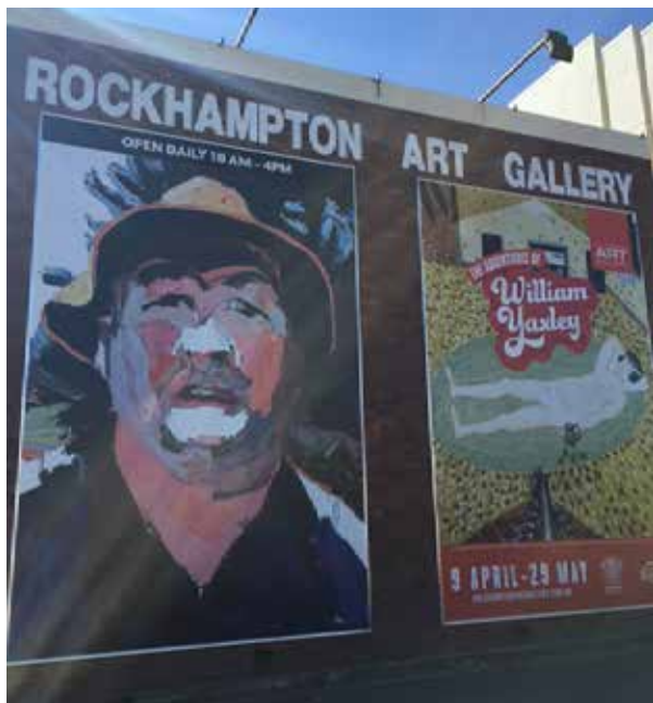
The Adventures of William Yaxley exhibition at the Rockhampton Art Gallery.