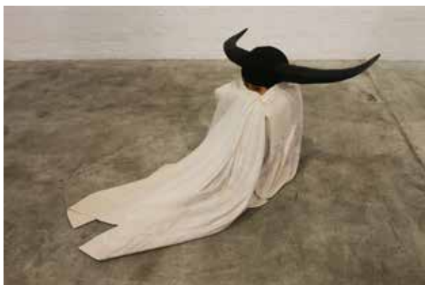
Abdul-Rahman Abdullah, The boy who couldn't sleep , 2017. Painted wood, buffalo horns, 56 x 127 x 74 cm.

M&G QLD has been successful in its application to the Australian Government's Visions of Australia program to support development of its contemporary Australian sculpture exhibition, Safe Space . The exhibition is a partnership between M&G QLD and Logan Art Gallery, and is curated by Christine Morrow. Safe Space will launch at Logan in November 2018 and is then planned to tour until 2021, subject to further funding.