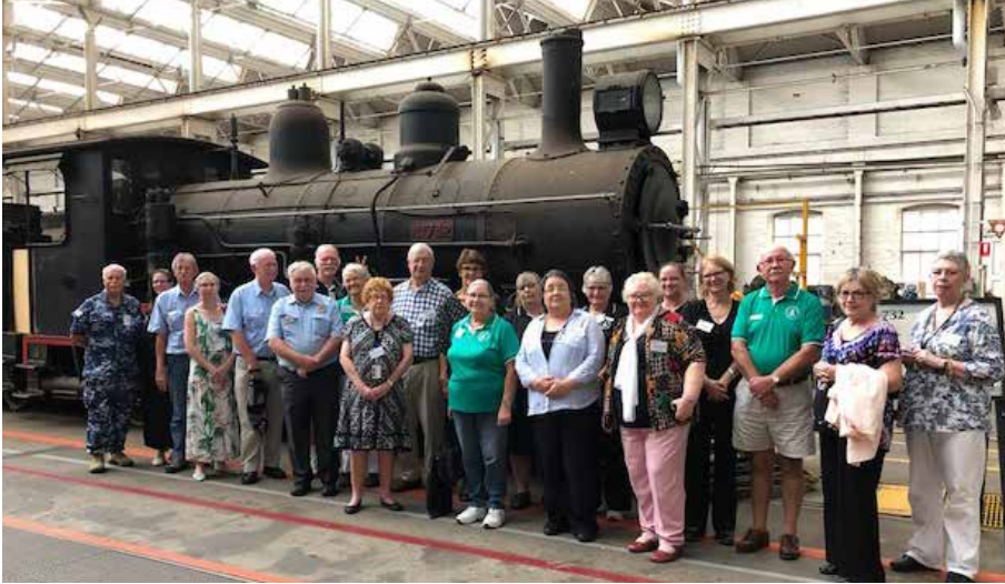
Standards Briefing Session held at The Workshops Rail Museum, Ipswich on 13 March 2018. Organisations represented included: Cooneana Heritage Centre, Ipswich Hospital Museum, Ipswich Soldiers Memorial Hall Museum, RAAF Amberley Aviation Heritage Centre, Jessie's Cottage Local History Museum, and Lockyer Valley Art Gallery.

The purpose of the full-day Briefing Session was to introduce participants to details of the Program and to begin the important task of completing the Self Review Survey. The session allowed organisations to ask specific questions and learn how to access relevant resources for completing the Self Review Survey.