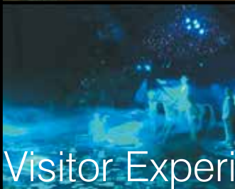
Visitor Experience Centres