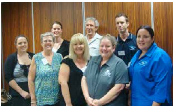
2014 Standards Review Program participants at the recent Briefing Session in Townsville.

completing the Self Review Survey. The session allowed organisations to ask specific questions and learn how to access relevant resources for completing the Self Review Survey.