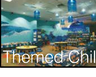
Themed Children's Spaces