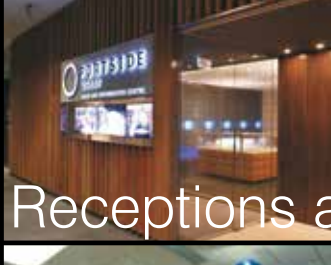
Receptions and Interiors