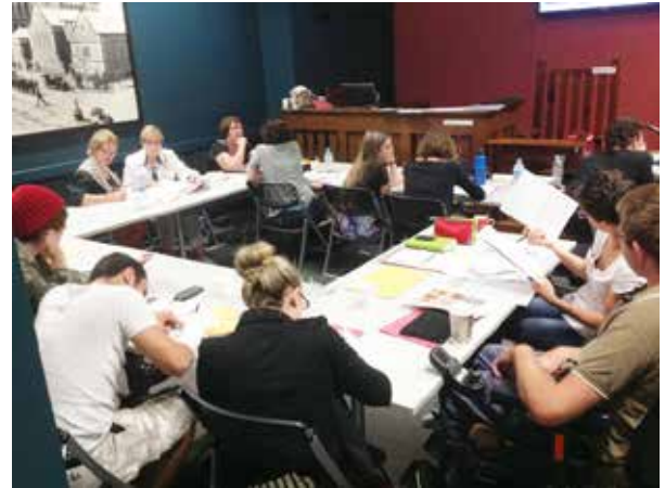
Cataloguing practice at the Queensland Police Museum during the Griffith University Social Enterprise Collection Management Workshop.