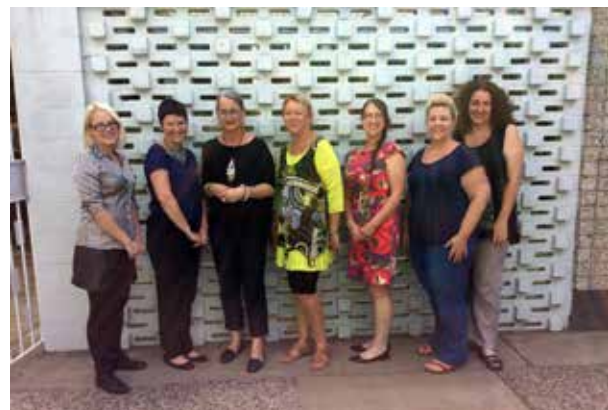
Top and centre: The end of an era for M&G QLD (and Regional Galleries Association of Queensland and Museums Australia Queensland) at Level 3, 381 Brunswick Street, Fortitude Valley as the office is packed for moving.