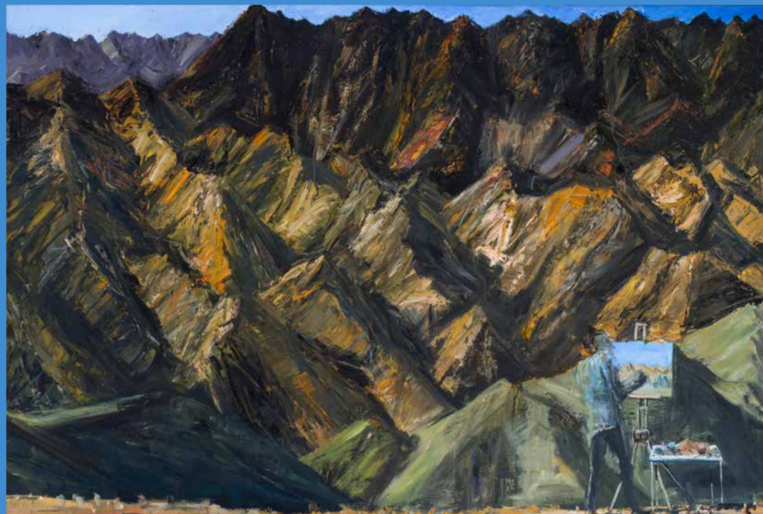
Euan Macleod, Painting Mountains , 2009. Oil on linen, 119 x 180 cm. From Tattersall's Club Landscape Art Prize exhibition, toured by Museums & Galleries Queensland. Courtesy of Tattersall's Club Landscape Art Prize Collection. Photo: Carl Warner.

source is published four times a year by Museums & Galleries Queensland and provides updates on programs, events and services.